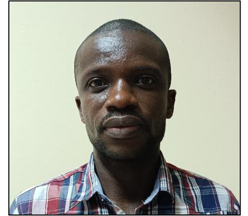
KOTO, Sena NTDs District Focal Point, Vo District